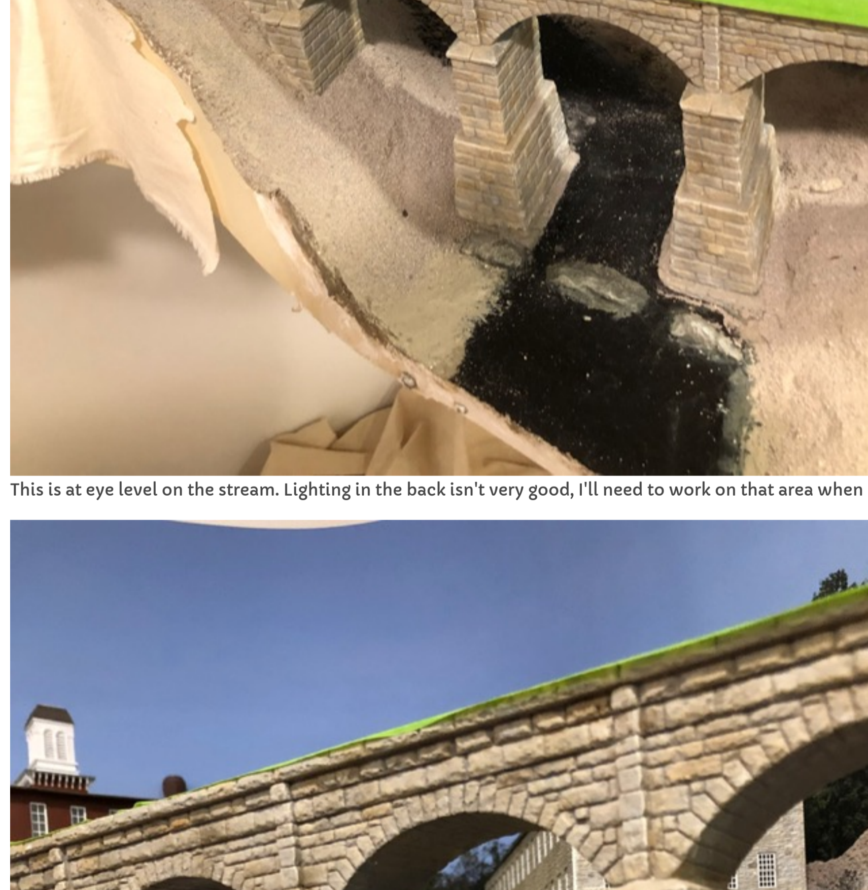
This is at eye level on the stream. Lighting in the back isn't very good, I'll need to work on that area when I'm ready to do layout lighting.